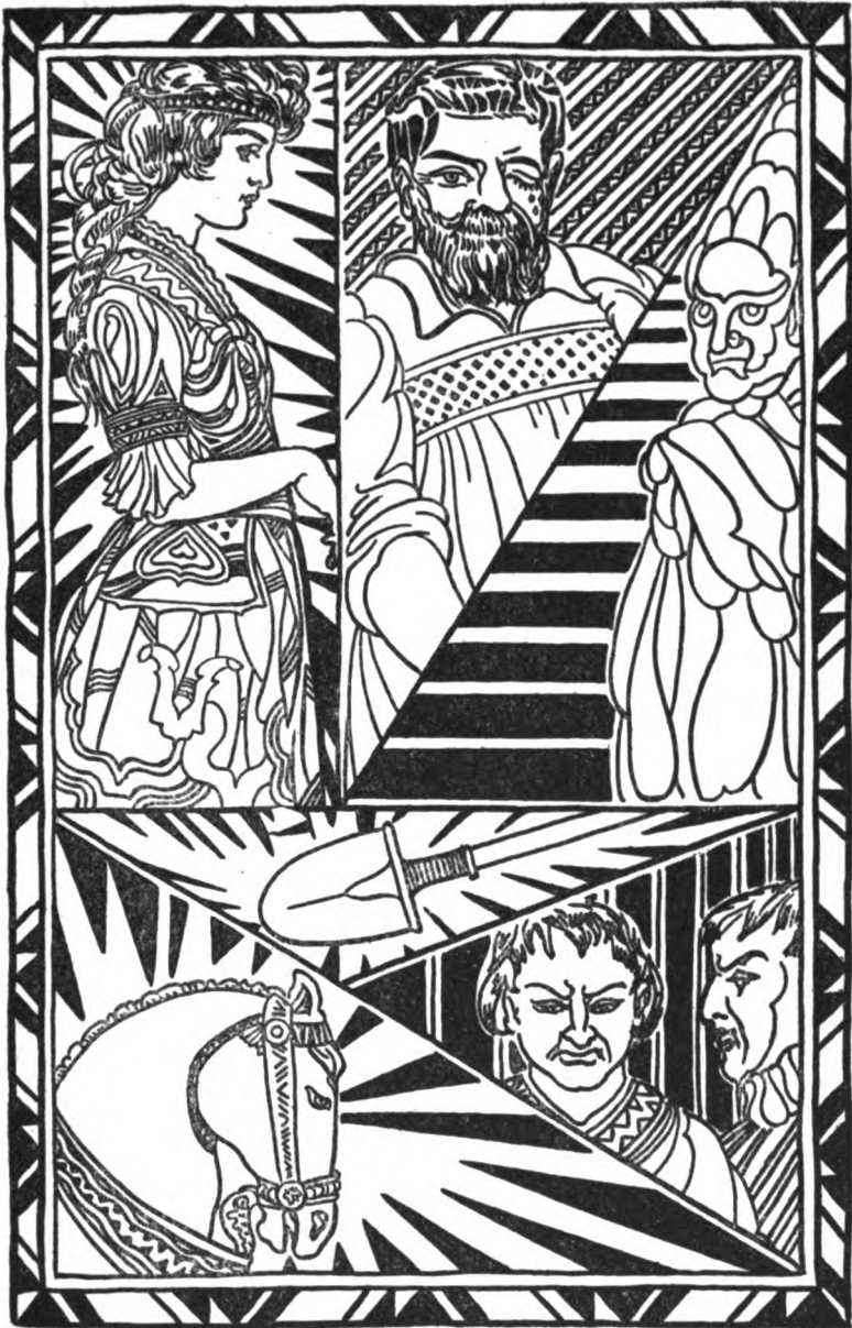
The Golden Maiden, the Farmer and the Empty Ghost